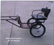
Shown with option: 20" #3 Wheels