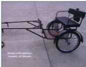
Shown with options: Fenders, #2 Wheels