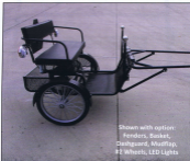
Shown with option: Fenders, Basket, Dashboard, Mudflap, #2 Wheels, LED Lights