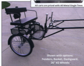
Shown with options: Fenders, Basket, Dashboard, 26" #2 Wheels.

All carts are priced with All Metal Single-Tires