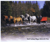
Draft Trailway Wagon Bed on Air Tires