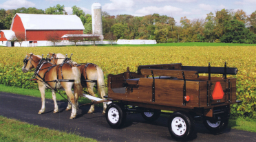
Haflinger Utility Wagon Bed on 1-Ton Pioneer Gear with Air Tires Optional USB Lights and Cushions On Rear BENCH

Perfect for a small team, or one large horse. Our Haflinger Wagon with a Trailway bed is easy to get on and off of, and is a very practical wagon for a trip to town. The Weaver Haflinger Wagon measures 51" at the outside of the wheels and 56" x 108" overall. Wood shafts are available, as well as bolster springs, torsion axles, mechanical or hydraulic brakes.