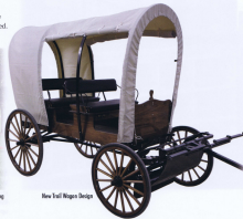
New Trail Wagon Design