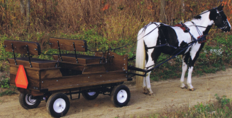
Pony Utility Wagon Bed on 1/2-Ton Pioneer Gear with Air Tires