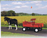
Pony Utility Wagon Bed on 1/2-Ton Pioneer Gear with Air Tires Optional Safety Flag

This wagon measures 32" at the outside of the wheels and 40" x 70" overall.