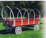
Brush classic wagon with extended wheelbase and custom pin-striping

Whether it is a simple modification to one of our standard wagons, or a complete custom design, we would be pleased to help you get just what you need.