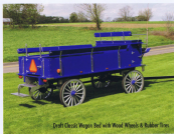
Draft Chassis Wagon Bed with Wood Wheels & Rubber Tires