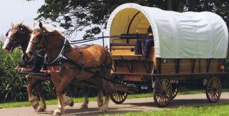
Draft Classic Wagon Bed on Three Iron Pioneer Gear with Wood Wheels & Rubber Tires Optional LED Lights and Canvas Top